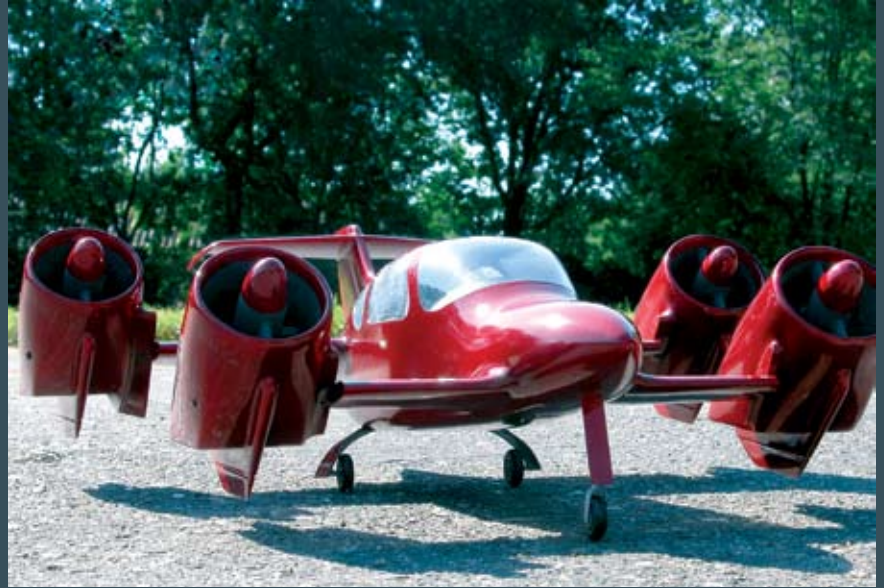
Moller's Skycar will revolutionise everyday travel.

Further information Website: www.moller.com