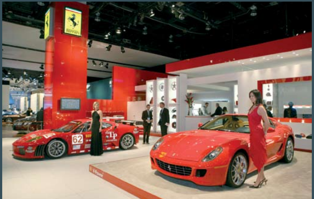
Ferrari's new car, the 599 GTB Fiorano, will offer extremely high speeds and superior handling.

suspension system), developed in collaboration with Delphi, which provides improved bump absorption and body control. There's also the enhanced manettino vehicle dynamics control switch, not to mention a wind tunnel-honed body that delivers greater downforce with increasing speed.